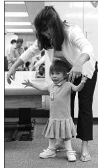
SMA patients being evaluated in Project Cure SMA clinical trials.

SMA Registry: We are excited to announce that other SMA advocacy groups (FightSMA, SMA Foundation, and the MDA) will be joining with us to fund the SMA Registry at Indiana University in 2008.